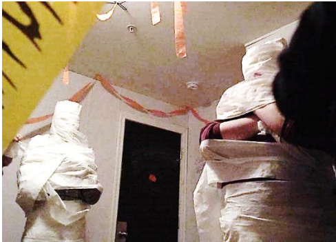
Railway folks having fun last Halloween!